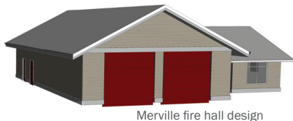
Merville fire hall design

A conceptual plan for a new firehall on Mount Washington is complete and an updated cost estimate is in process. The CVRD expects that the revised cost will likely need residents' approval because of the change since last approvals. Timing for that public input will be confirmed once all the required information is confirmed. Once that timeline is in place, the CVRD will be able to update the community on proposed timing for future construction of the fire hall.